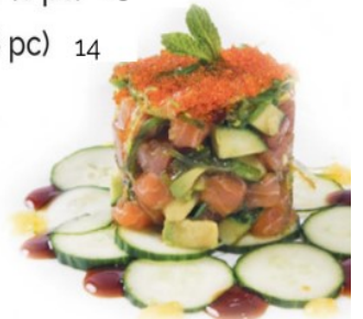
Hawaiian Poke Salad

Miso Soup 4 Fermented soybean soup, tofu, seaweed, scallions